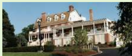
October 18 Change of Watch Kitty Knight House Georgetown, MD