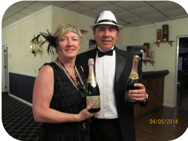
The Best Dressed Gatsby Winners